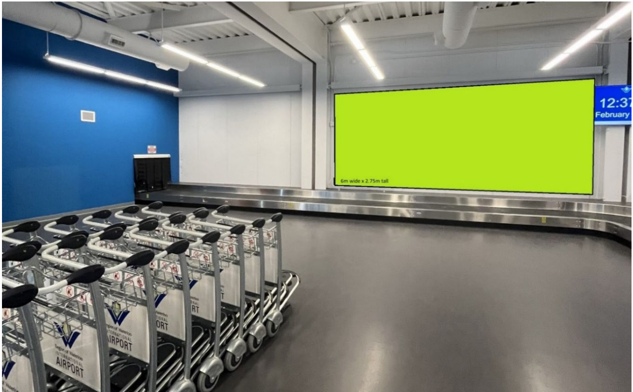
Left wall of Domestic Arrivals Building